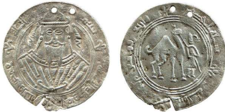
Figure 15: Silver medallion of al-Mutawakkil (847-861), 241 Hira (=855 CE). Vienna, Kunsthistorisches Museum, inv. no. MK_OR_7283.

During the ninth and tenth centuries, the epic stories of the Persian heroes and kings had already become an integral part of Islamic civilization and the various dynasties of Iranian origin who succeeded in seizing power in the former Sasanian realm, although observing the Islamic faith and being more or less Arabized, attempted to revive the glory of the Iranian past and linked their lineage to that of their Sasanian predecessors. 29 The Buyids (930–1062) chose Wahram (V) Gur (420–438) as the dynasty’s ancestor, while the lineage of the Samanids (819–1005) was traced back to Wahram (VI) Chobin (590–591). Both these Sasanian monarchs are very popular figures in the Persian epics. 30