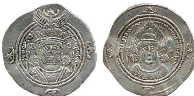
Figure 13: Silver drachm of Khusro II (591-628), 37th regnal year. Vienna, Kunsthistorisches Museum, inv. no. MK_OR_7264.

The crowns which were made of gold and silver and were decorated with pearls and precious stones became so heavy that the kings were no longer able to wear them. It is supposed that from the time of Khusro I (531–579) they were suspended on a golden chain in the throne room above the throne at a height where they just brushed the monarch's head. The crown of Khusro II (591–628) is said to have been made of pure gold and had a weight equivalent to 60 men (figs. 12 and 13). When Ctesiphon was conquered by the Arabs in 637, Khusro's crown was sent to Caliph 'Umar, who had it hung in the Ka'aba in Mecca. 24 The custom of the hanging crown was also adopted in Byzantine court ceremonial as reported by Benjamin de Tudela, who visited the palace of Emperor Manuel I Comnenus (1143–1180) in Constantinople around 1170. 25