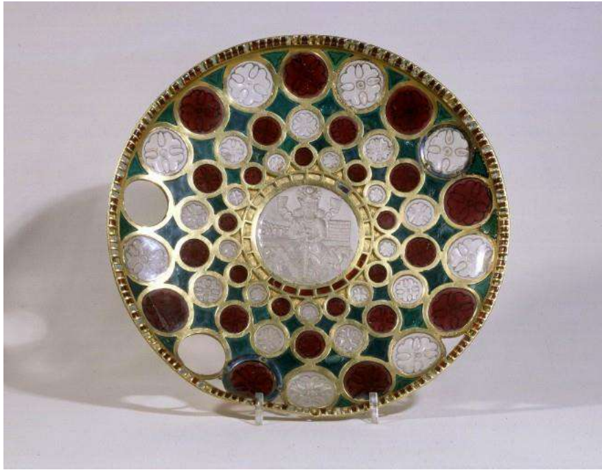
Figure 19: Gold, rock-crystal, and glass bowl with enthroned king, 6th century CE. Paris, Bibliothèque nationale de France, Département des Monnaies, médailles et antiques.