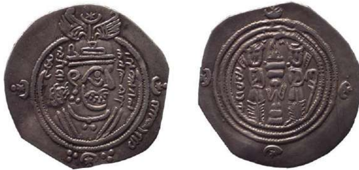
Figure 14: Silver drachm of ‘Abdallah ibn al-Zubair (680-692), 63 Hira (=682 CE), mint of Darabgird. Vienna, Kunsthistorisches Museum, inv. no. MK_OR_6988.

Bigah tribe in Sudan on a silver medallion (fig. 15). 27 The Buyid Amir Rukn ad-Dawla (c. 935–976) used the Sasanian model for his depiction on a gold commemorative medallion from the year 970 / AH 359, choosing the old Sasanian title “may the Shahanshah’s xwārrha increase.” 28