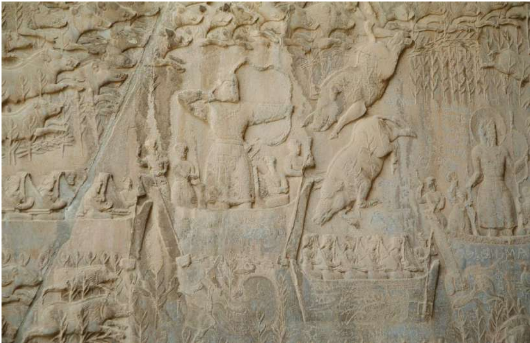
Figure 8: Hunting scenes on the side wall of the niche at Taq-i Bustan with Khusro II.

we know at least of 31 Sasanian kings – the composition of the crowns became ever more complicated as a variety of different emblems were used and their individual characteristics diminished (cf. figs. 2, 3, 5, 12 and 13).