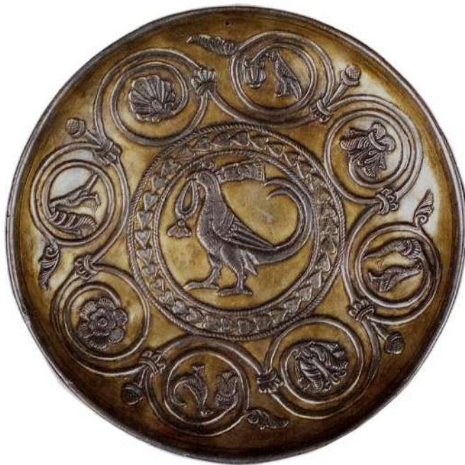
Figure 11: Silver-gilt dish with a pheasant holding a necklace in his peak, St. Petersburg, Hermitage Museum, inv. no. S-18 (Cat. Brussels 1993, p. 217, no. 69).