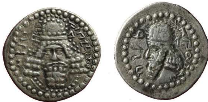
Figure 1: Silver drachm of Ardashir I as king of Fars, after 205/6-224. Private Collection.

of independence from the Seleucids which it maintained under Parthian rule. 13 On their coins, the kings of Fars presented themselves like their Achaemenid predecessors as adherents of the Zoroastrian religion, and in contrast to their Parthian overlords, who inscribed their coins mainly in Greek, the kings of Fars used Middle Persian as their official language. In a way they felt themselves to be the true heirs of the Persian tradition and regarded their Parthian overlords as dishonourable apostates, unworthy to rule the land of the Aryans. The leader of this revolt was a certain Ardashir, who made himself king of Fars (fig. 1) and eventually killed the Parthian king of kings Artaban IV in battle, an incident that is supposed to have taken place in the year 223/24. 14