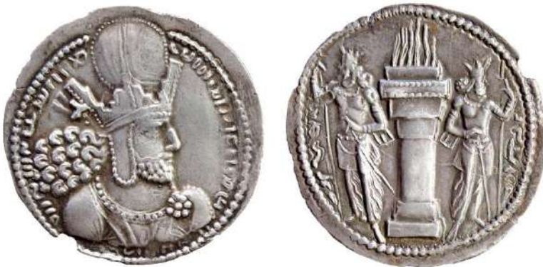
Figure 5: Silver drachm of Shapur I (240-272). Vienna, Kunsthistorisches Museum, inv. no. MK_OR_2184.

Ardashir's son, Shapur I (fig. 5), is best known for his victories over the Romans which he had immortalized in five monumental rock reliefs (fig. 6). He also extended the royal title from šāhānšāh Ērān to šāhānšāh Ērān ud Anērān , i.e. “king of kings of the Iranians and Non-Iranians”. This new title represented a further step in the dynasty's efforts to create a distinct Iranian identity. For Shapur, Anērān primarily stood for those countries he had been able to conquer from the Romans. Thereafter it might also have assumed a religious connotation, differentiating between those who followed the right religion (i.e. Zoroastrianism) and those who did not. 18