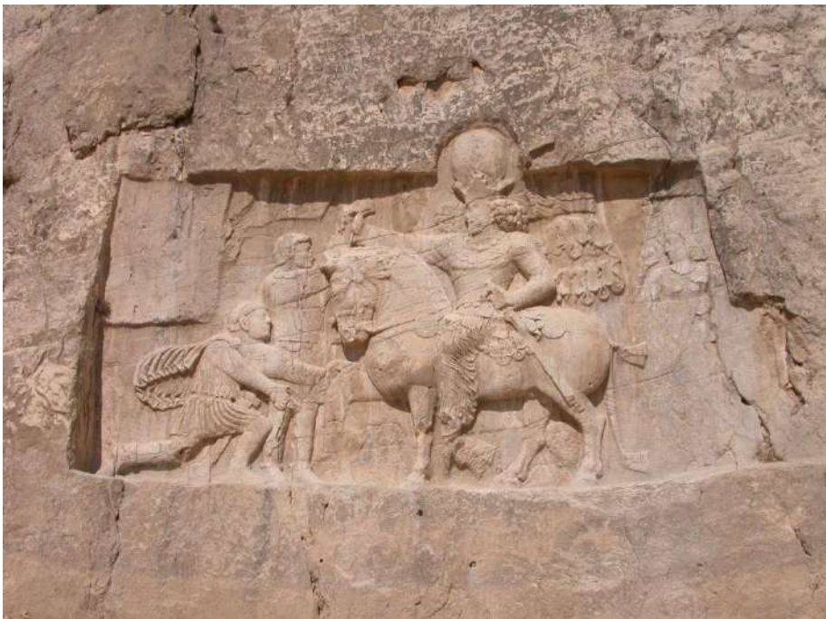
Figure 6: Relief of Shapur I at Naqsh-i Rostam (6), showing his triumph over the Roman emperors Philip the Arab and Valerian, after 260 CE.