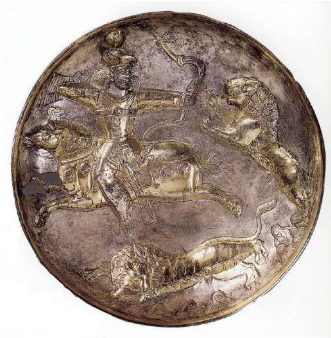
Figure 17: Silver-gilt plate with Ohrmazd II hunting lions, 4th century CE. Cleveland Museum of Art, acc. No. 62.150.