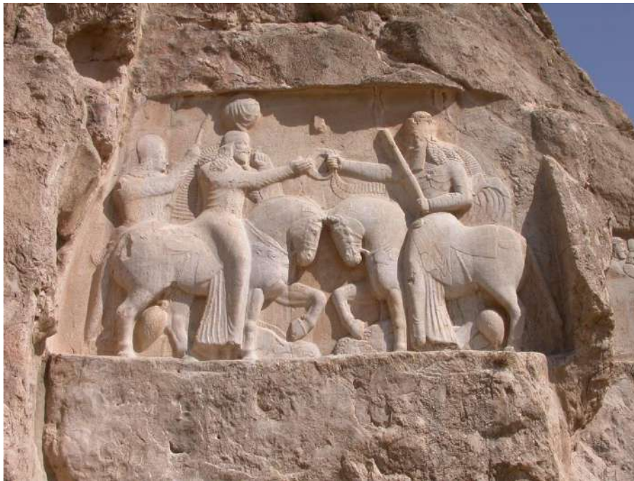
Figure 4: Relief of Ardashir I at Naqsh-i Rostam (1), showing his investiture by Ahura Mazda, after 228/29 CE.