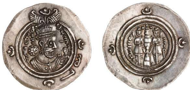
Figure 12: Silver drachm of Khusro II (591-628), 25th regnal year, mint of Hamadan. Private Collection.