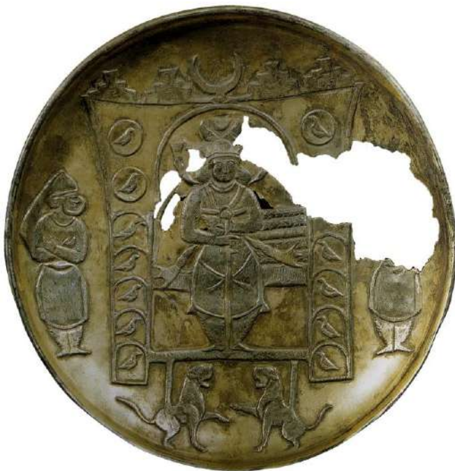
Figure 20: Silver-gilt plate from Qazvin with enthronement scene, 7th century CE. Tehran, National Museum of Iran, inv. no. 904 (Cat. Vienna 2000, pp. 284-286, no. 156).

In foreign policy, the Sasanians faced the problem of having to secure their borders against Rome (later Byzantium), their arch-enemy, on the one side, and against charging Central Asian nomads on the other. In late Antiquity, this strategic dilemma was also shared by