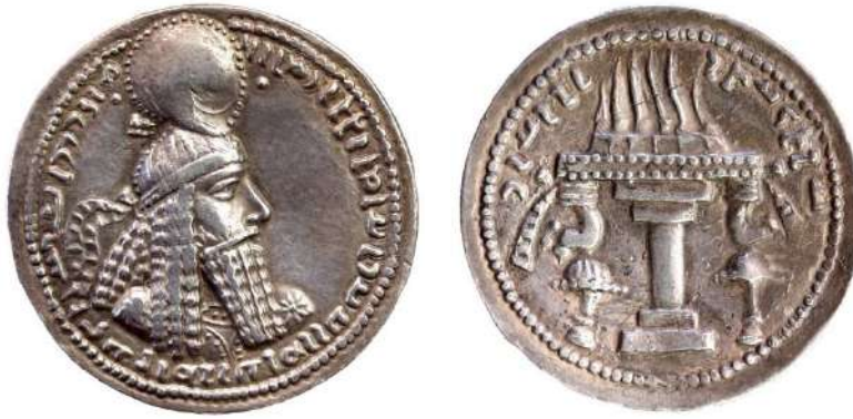
Figure 2: Silver drachm of Ardashir I (224-240) as King of Kings. Vienna, Kunsthistorisches Museum, inv. no. MK_OR_6379.