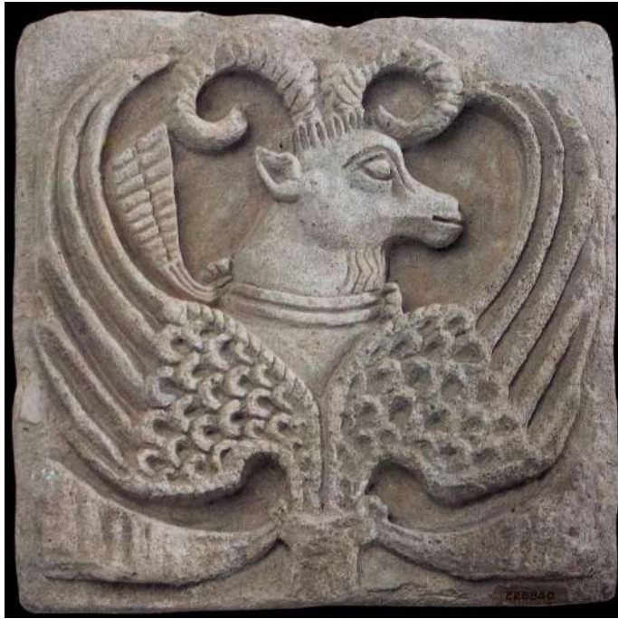
Figure 7: Stucco panel showing a ram’s head above a pair of wings; diadems with long ribbons are tied around the neck and the wings, 5th century CE. Chicago, The Field Museum of Natural History, inv. no. 228840 (Cat. Brussels 1993, p. 149, no. 8).

The xwārrah or “Divine Glory” was an essential element of legitimacy and divine sanction in the royal Iranian ideology. It distinguishes the king from any other human being and gives him the right to rule. In the visual arts the xwārrah was expressed in multiple ways from the Achaemenids to the post-Caliphate period: a pair of wings, a falcon (fig. 3), a ram with flying ribbons (fig. 7), pearl roundels or a halo around the king’s head were all interpreted as signs of “Divine Glory.” 20