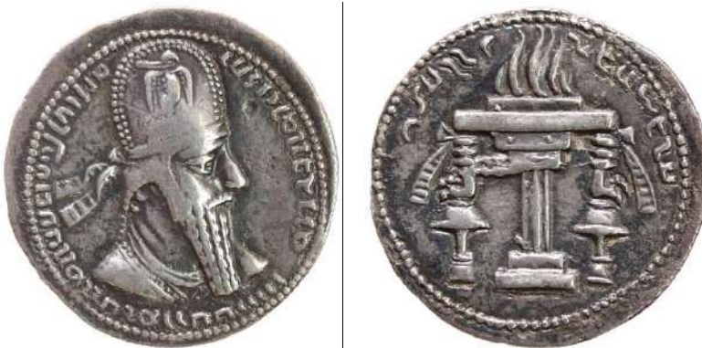
Figure 3: Silver drachm of Ardashir I (224-240) as King of Kings; on the king's tiara a falcon with a diadem in his peak. Vienna, Kunsthistorisches Museum, inv. no. MK_OR_6379.