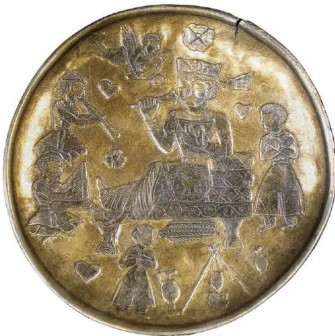
Figure 18: Silver-gilt dish with king seated on a banqueting couch accompanied by servants and musicians, 7th / early 8th century (St. Petersburg, Hermitage Museum, inv. no. S-47 (Cat. Brussels 1993, p. 210, no. 64).