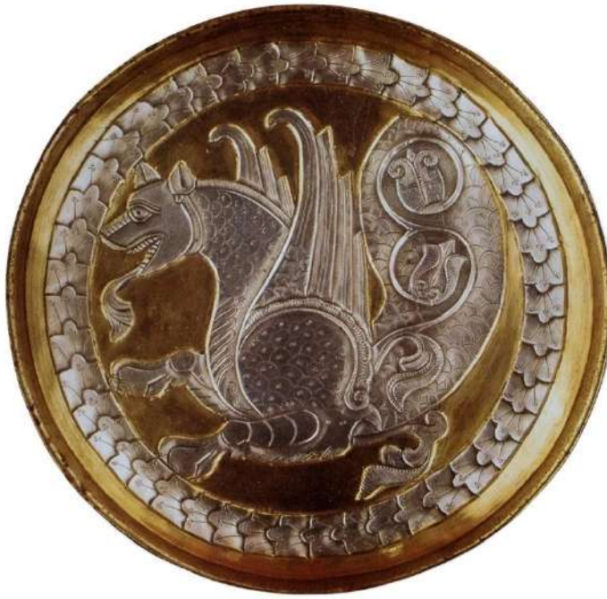
Figure 10: Silver-gilt dish with a Senmurv, 7th / 8th century. London, The British Museum, inv. no. BM 124095 (Cat. Brussels, pp. 220-221, no. 71).