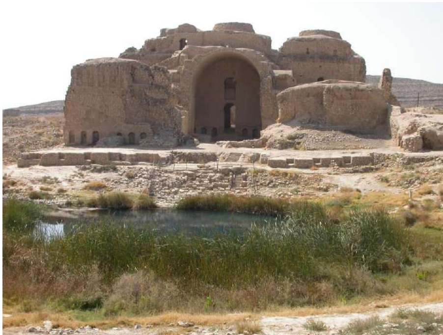
Figure 16: Ardashir I's palace at Firuzabad.

The most typical and impressive elements of the Sasanians' cultural heritage included the magnificent palaces (fig. 16) and manor houses, richly decorated with stucco, mosaics, and carpets; the huge hunting grounds in which all kinds of animals were gathered to serve the king's pleasure in the chase (figs. 8 and 17); the precious silverware produced both at the royal court and in the provincial workshops of the local aristocracy (figs. 10-11, 17, 18, 20). Another legendary feature was the royal banquets, where all kinds of luxury dishes, wine, and other drinks were served while the king and his courtiers were entertained with music and various games (fig. 18). 32 These banquets at court constituted an important part of the social interaction between the king and his nobles and were also intended to express the empire's high level of prosperity. 33 The king as a glorious heroic hunter as well as the banquet scenes became prominent topics in the visual arts of the empire, and like the Persian epics, continued to be highly popular during the Muslim era.