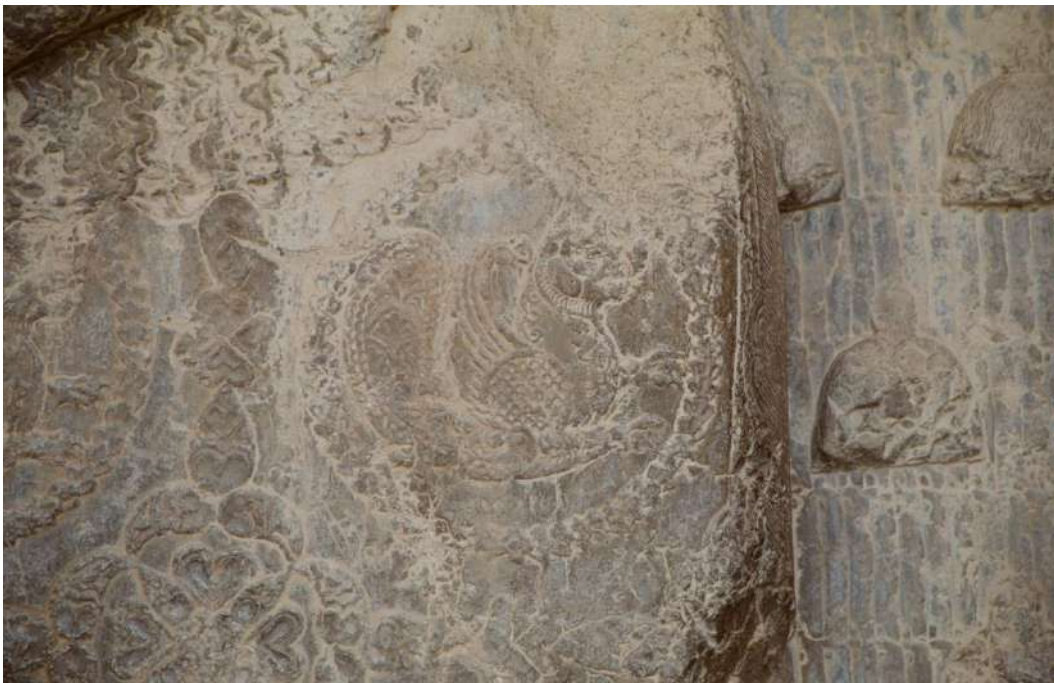
Figure 9: Senmurv on Khusro's II robe at Taq-i Bustan.