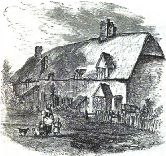
MOTHER SHIPTON'S HOUSE.*

Merlin, Shipton, and Nixon, who fixed their minds upon higher things than the weather, and were not so restrained as to prophesy for only one year at a time. After such prophets the almanac-makers hardly deserve to be mentioned; not even the renowned Partridge, whose prognostications set all England agog in 1708, and whose death while still alive was so pleasantly and satisfactorily proved by Isaac Bickerstaff. The anti-climax would be too palpable, and they and their doings must be left uncommemorated.