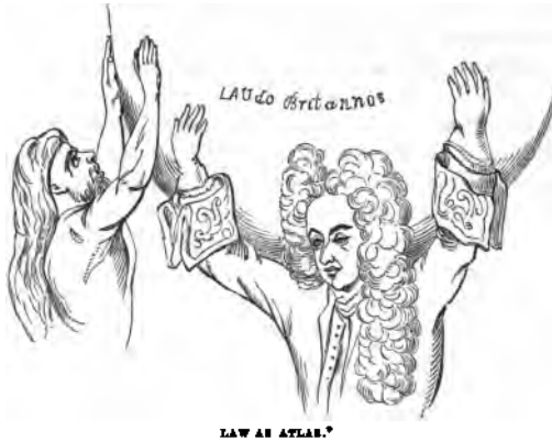
LAW AS ATLAS.*

At this time he was by far the most influential person of the state. The Duke of Orleans had so much confidence in his sagacity and the success of his plans, that he always consulted him upon every matter of moment. He was by no means unduly elevated by his prosperity, but remained the same simple, affable, sensible man that he had shewn himself in adversity. His gallantry, which was always delightful to the fair objects of it, was of a nature so kind, so gentlemanly, and so respectful, that not even a lover could have taken offence at it. If upon any occasion he shewed any symptoms of haughtiness, it was to the cringing nobles who lavished their adulation upon him