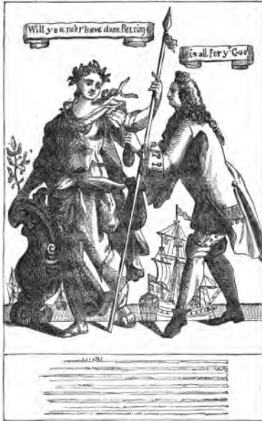
BRITANNIA STRIPPED BY A SOUTH-SEA DIRECTOR.*

they ought upon this occasion to follow the example of the ancient Romans, who, having no law against parricide, because their legislators supposed no son could be so unnaturally wicked as to embrace his hands in his father's blood, made a law to punish this heinous crime as soon as it was committed. They adjudged the guilty wretch to be sewn in a sack, and thrown alive into the Tiber. He looked