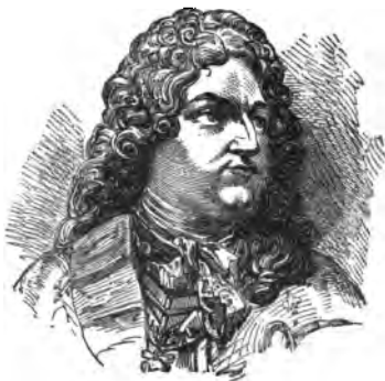
THE REGENT OF FRANCE.