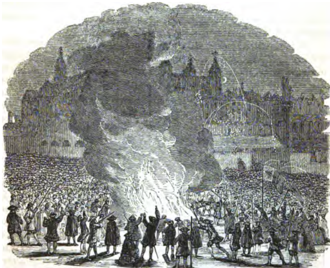
BONFIRES ON TOWER HILL

entertained, especially as the examination of a still greater delinquent was expected by many to have a similar termination. Mr. Aislable, whose high office and deep responsibilities should have kept him honest, even had native principle been insufficient, was very justly regarded as perhaps the greatest criminal of all. His case was entered into on the day succeeding the acquittal of Mr. Stanhope. Great excitement prevailed, and the lobbies and avenues of the House were beset by crowds, impatient to know the result. The debate lasted the whole day. Mr. Aislable found few friends: his guilt was so apparent and so heinous that nobody had courage to stand up in his favour. It