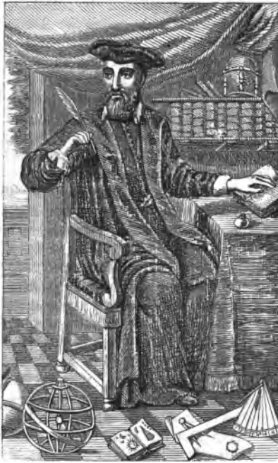
NOSTRADAMUS.—FROM THE FRONTISPECE TO A COLLECTION OF HIS PROPHECIES, PUBLISHED AT AMSTERDAM, A.D. 1666.

In France and Germany astrologers met even more encouragement than they received in England. In very early ages Charlemagne and his successors fulminated their wrath against them in common with sorcerers. Louis XI., that most superstitious of men, entertained great numbers of them at his court; and Catherine de Medicis, that most superstitious of women, hardly ever undertook any affair of importance without consulting them. She chiefly favoured her own countrymen; and during the time she governed France, the land was overrun by Italian conjurors, necromancers, and fortune-tellers of every kind.