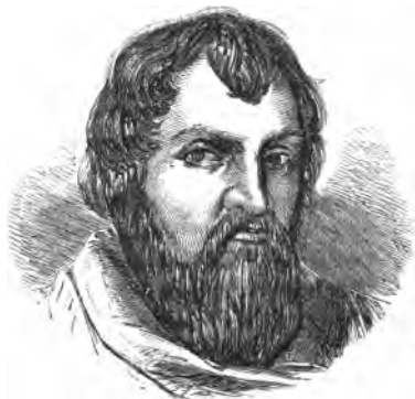
ARNOLD DE VILLENEUVE.

This philosopher has left a much greater reputation. He was born in the year 1245, and studied medicine with great success in the university of Paris. He afterwards travelled for twenty years in Italy and Germany, where he made acquaintance with Pietro d'Apone, a man of a character akin to his own, and addicted to the same pursuits. As a physician, he was thought, in his own lifetime, to be the most able the world had ever seen. Like all the learned men of that day, he dabbled in astrology and alchymy, and was thought to have made immense quantities of gold from lead and copper. When Pietro d'Apone was arrested in Italy, and brought to trial as a sorcerer, a similar accusation was made against Arnold; but he managed to leave the country in time, and escape the fate of his unfortunate friend. He lost some credit by predicting the end of the world, but afterwards regained it. The time of his death is not exactly known; but it must have been prior to the year 1311, when Pope Clement V. wrote a circular letter to all the clergy of Europe who lived under his obedience, praying them to use their utmost efforts to discover the famous treatise of Arnold on The Practice of