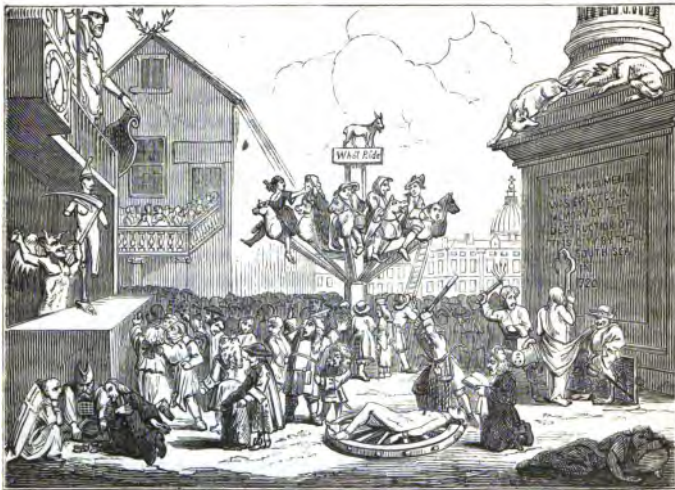
THE SOUTH-SEA BUBBLE.—CARICATURE BY HOGARTH.*

laws of the land. The intemperate notions of Lord Molesworth were not literally acted on ; but a bill of pains and penalties was introduced—a retro-active statute, to punish the offences which did not exist at the time they were committed. The legislature restrained the persons of the directors, imposed an exorbitant security for their appearance, and marked their character with a previous note of ignominy. They were compelled to deliver, upon oath, the strict value of their estates, and were disabled from making any transfer or alienation of any part of their property. Against a bill of pains and penalties, it is the common right of every subject to be heard by his counsel at the bar. They prayed to be heard. Their prayer was refused, and their oppressors, who required no evidence, would listen to no defence. It had been at first proposed, that one-eighth of