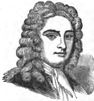
SIR ROBERT WALPOLE.

The bill was two months in its progress through the House of Commons. During this time every exertion was made by the directors and their friends, and more especially by the chairman, the noted Sir John Blunt, to raise the price of the stock. The most extravagant rumours were in circulation. Treaties between England and Spain were spoken of, whereby the latter was to grant a free trade to all her colonies; and the rich produce of the mines of Potosi-la-Paz was to be brought to England until silver should become almost as plentiful