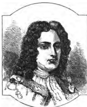
EARL OF SUNDERLAND.

That part of the report of the Committee of Secrecy which related to the Earl of Sunderland was next taken into consideration. Every effort was made to clear his lordship from the imputation.