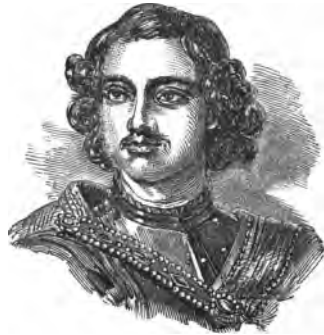
PETER THE GREAT.

But among all the instances of the interference of governments with men's hair, the most extraordinary, not only for its daring, but for its success, is that of Peter the Great, in 1705. By this time fashion had condemned the beard in every other country in Europe, and with a voice more potent than popes or emperors, had banished it from civilised society. But this only made the Russians cling more fondly to their ancient ornament, as a mark to distinguish them from foreigners, whom they hated. Peter, however, resolved that they should be shaven. If he had been a man deeply read in history, he might have hesitated before he attempted so despotic an attack upon