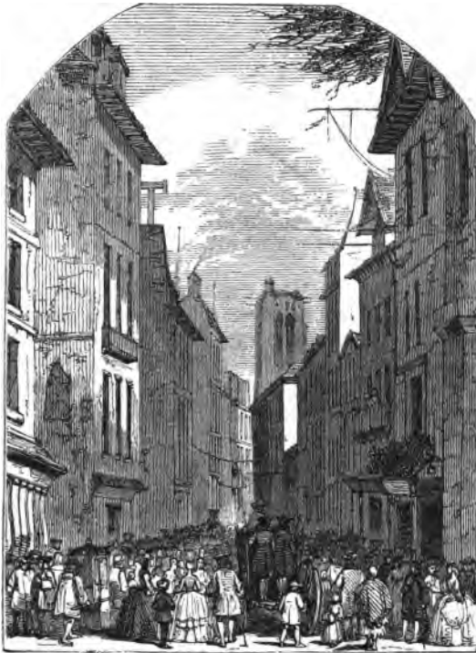
LAW'S HOUSE; RUE DE QUINCAMPOIX.

an edict was published, granting to the Mississippi Company the exclusive privilege of trading to the East Indies, China, and the South Seas, and to all the possessions of the French East India Company, established by Colbert. The Company, in consequence of this great increase of their business, assumed, as more appropriate, the title of Company of the Indies, and created fifty thousand new shares. The prospects now held out by Law were most magnificent. He promised a yearly dividend of two hundred livres upon each share of five hundred, which, as the shares were paid for in billets d'état , at their nominal value, but worth only 100 livres, was at the rate of about 120 per cent profit.