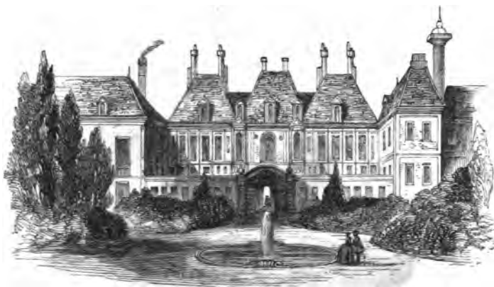
HOTEL DE SOISSONS.

was concluded, by which Law became the purchaser of the hotel at an enormous price, the prince reserving to himself the magnificent gardens as a new source of profit. They contained some fine statues and several fountains, and were altogether laid out with much taste. As soon as Law was installed in his new abode, an edict was published, forbidding all persons to buy or sell stock any where but in the gardens of the Hôtel de Soissons. In the midst, among the trees, about five hundred small tents and pavilions were erected, for the