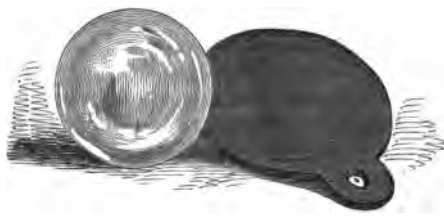
NEW-STONE OF DR. DEE, IN THE BRITISH MUSEUM.

peared. Dee found from experience of the crystal that it was necessary that all the faculties of the soul should be concentrated upon it, otherwise the spirits did not appear. He also found that he could never recollect the conversations he had with the angels. He therefore determined to communicate the secret to another person, who might converse with the spirit while he (Dee) sat in another part of the room, and took down in writing the revelations which they made.