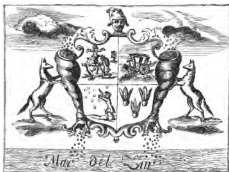
THE SUNBURNERS' ARMS—PROSPERITY.

LONDON: OFFICE OF THE NATIONAL ILLUSTRATED LIBRARY, 227 STRAND.