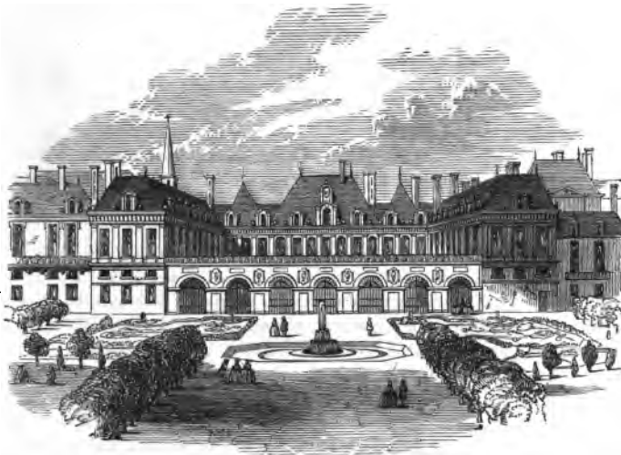
PALAIS ROYAL FROM THE GARDEN.

tion, passed another decree, dated August 12th, 1718, by which they forbade the bank of Law to have any concern, either direct or indirect, in the administration of the revenue; and prohibited all foreigners, under heavy penalties, from interfering, either in their own names, or in that of others, in the management of the finances of the state. The parliament considered Law to be the author of all the evil, and some of the councillors, in the virulence of their enmity, proposed that he should be brought to trial, and, if found guilty, be hung at the gates of the Palais de Justice.