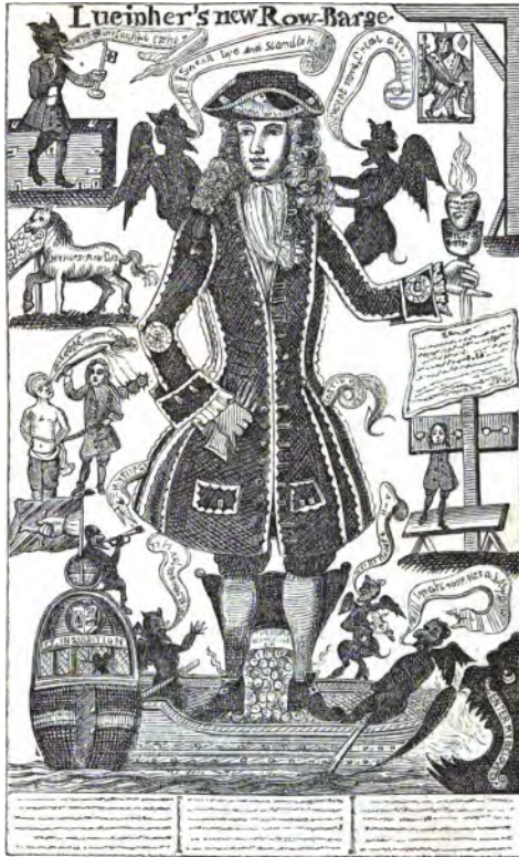
LUCIFER'S NEW ROW-BARGE.*

ten in silver. All these measures were nugatory to restore confidence in the paper, though the restriction of cash payments within limits so extremely narrow kept up the credit of the bank.