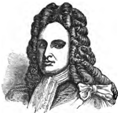
HARLEY EARL OF OXFORD.

Even at this early period of its history the most visionary ideas were formed by the company and the public of the immense riches of