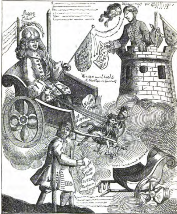
LAW IN A CAR DRAWN BY COCKS.*

committed many faults. I committed them because I am a man, and all men are liable to error; but I declare to you most solemnly that none of them proceeded from wicked or dishonest motives, and that nothing of the kind will be found in the whole course of my conduct."