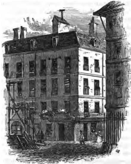
HOUSE OF CAGLIOSTRO, PARIS.

He was by this time wearied of the provinces, and turned his thoughts to the capital. On his arrival he announced himself as the restorer of Egyptian Freemasonry, and the founder of a new philosophy. He immediately made his way into the best society by means of his friend the Cardinal de Rohan. His success as a magician was quite extraordinary: the most considerable persons of the time visited him. He boasted of being able, like the Rosicrucians, to converse