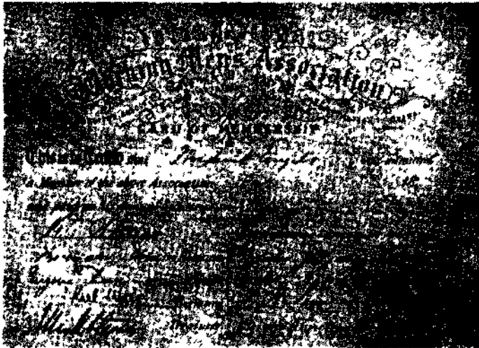
Annual Subscription Card of the International Working Men's Association