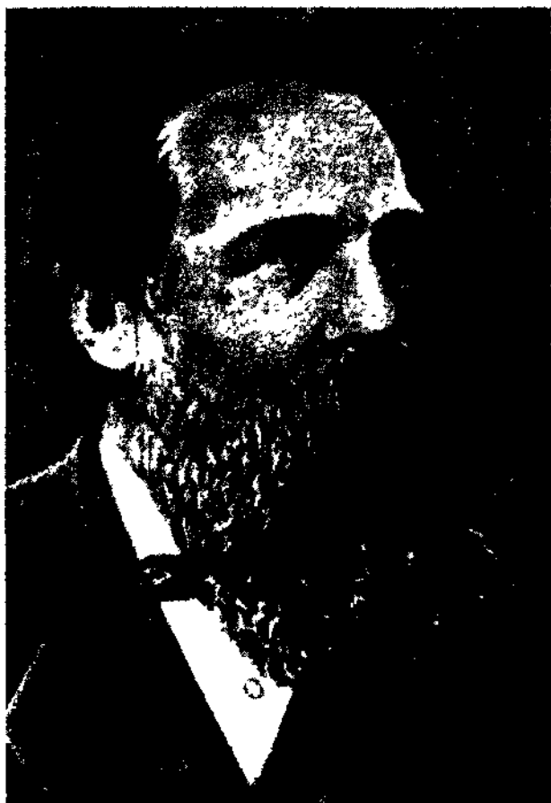
FRIEDRICH ENGELS (1820-1895)