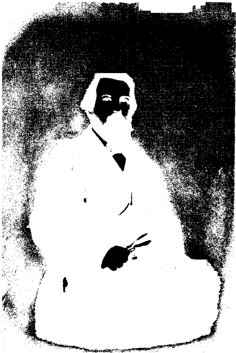
FRIEDRICH ENGELS, THE MANCHESTER MILL-OWNER.