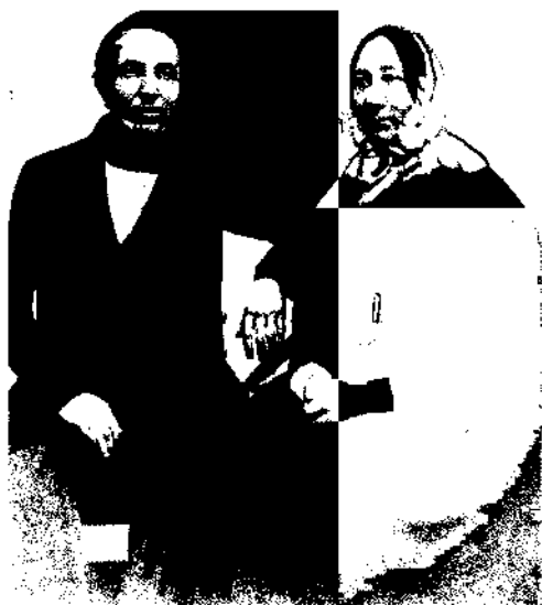
THE PARENTS OF FRIEDRICH ENGELS.