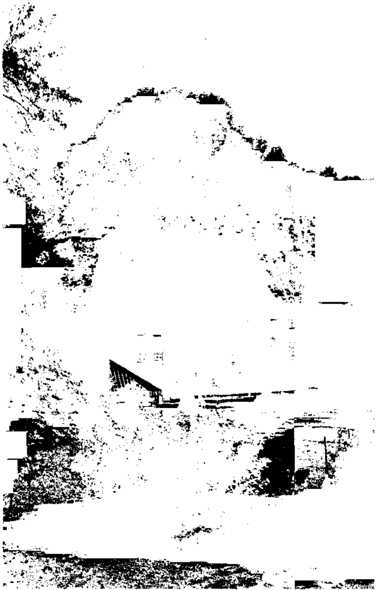
BIRTHPLACE OF ENGELS IN BARMEN.